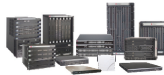
Switches, Routers, Wireless