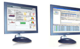
IPS, SIEM and Network Access Control